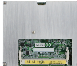
ET839 with heat spreader